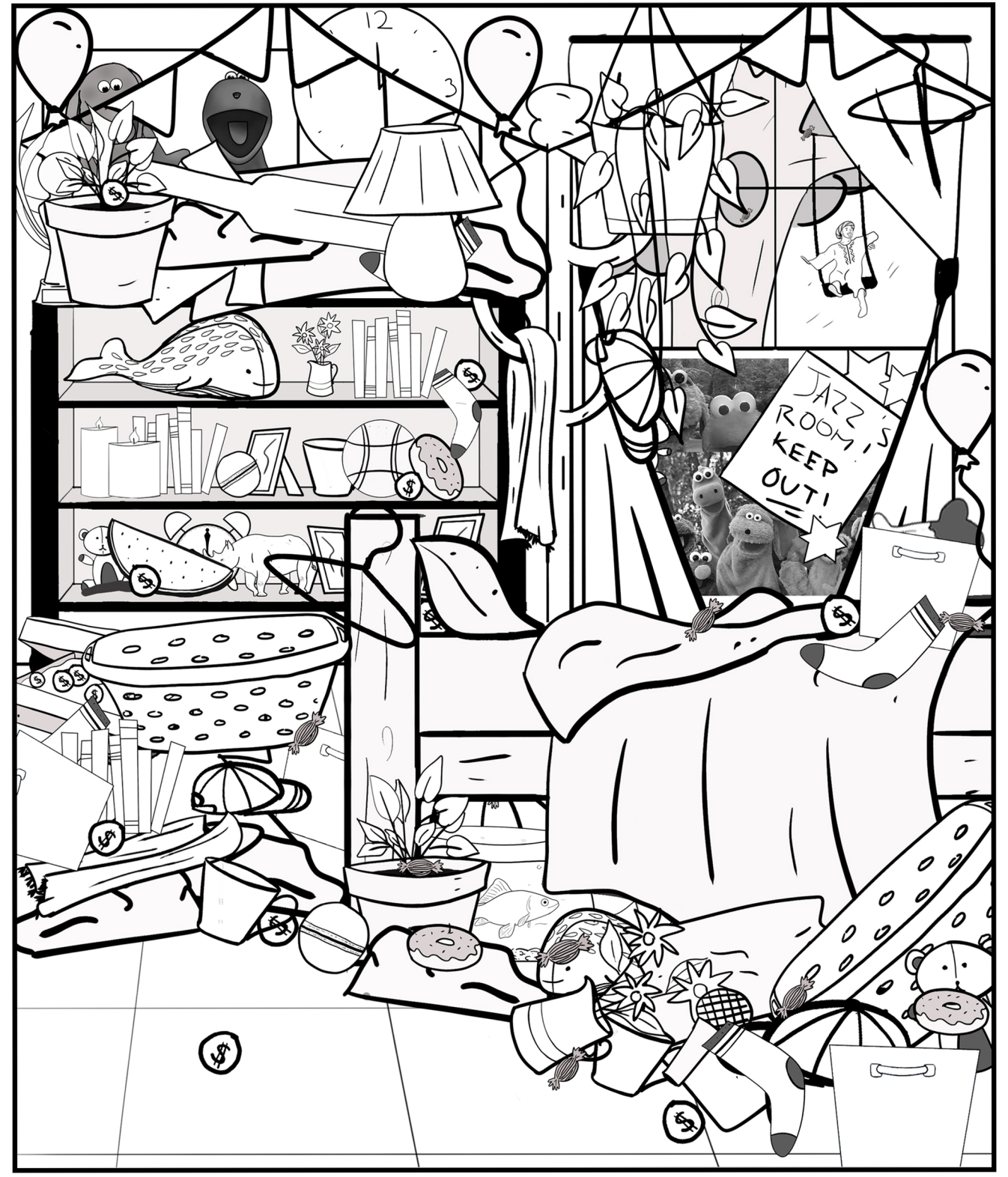
Find these items in Jazz's messy bedroom: